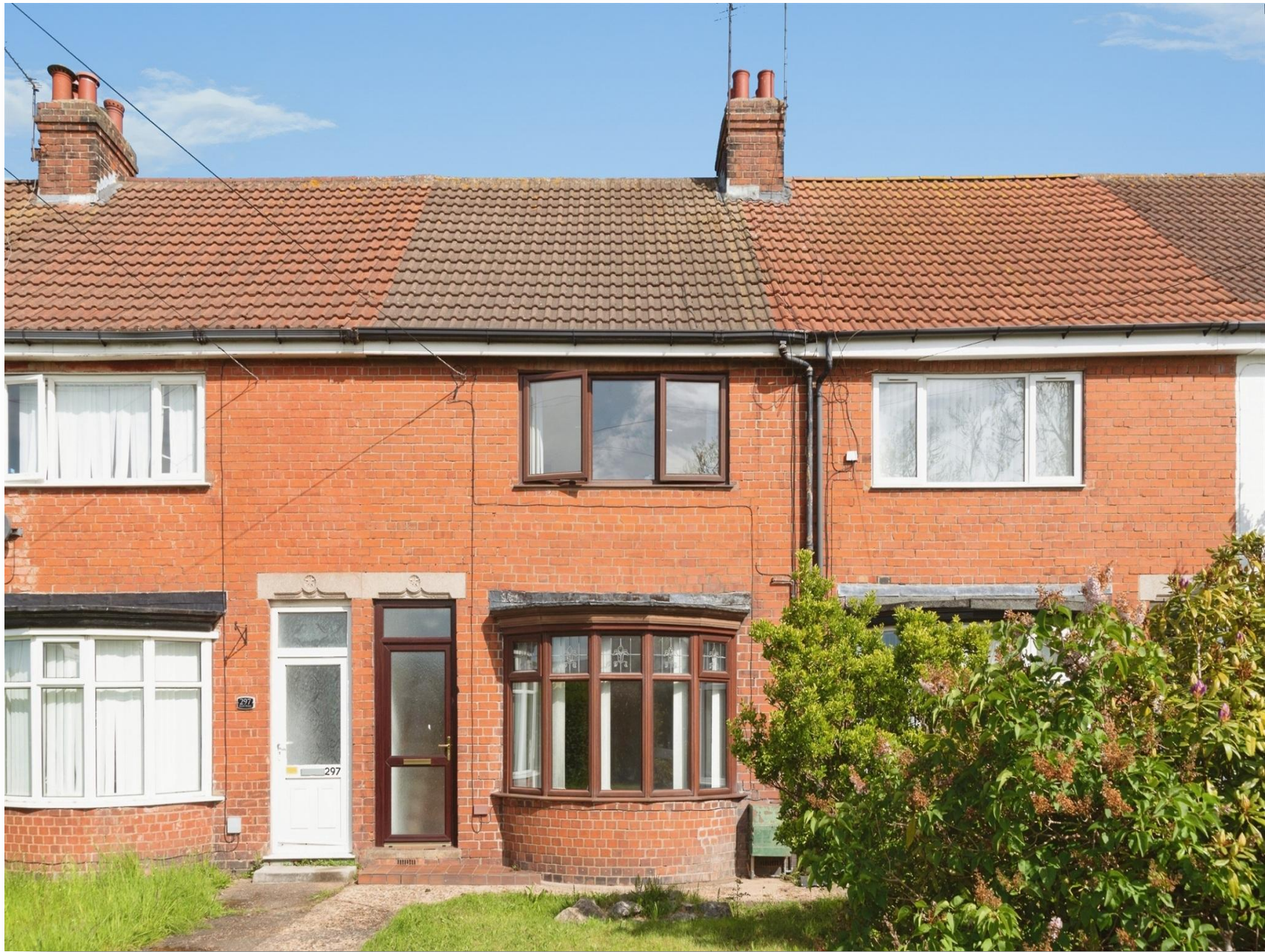
Main Road, Bilton, Hull, HU11 4DT