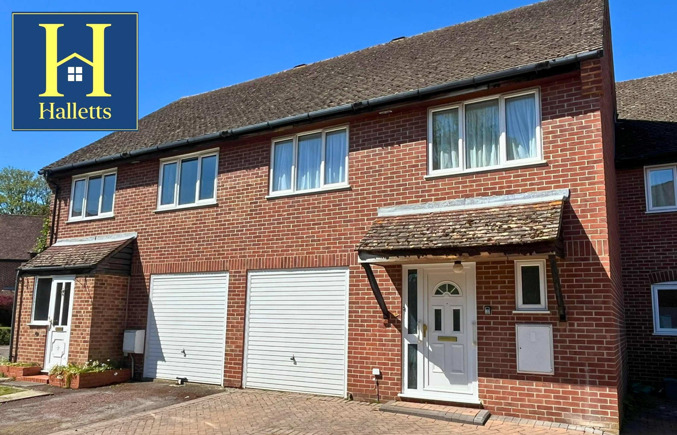
16 Cleveland Grove Newbury Berkshire RG14 1XF