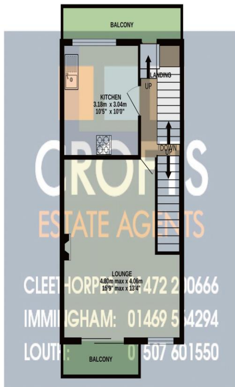
1ST FLOOR 36.0 sq.m. (387 sq.ft.) approx.