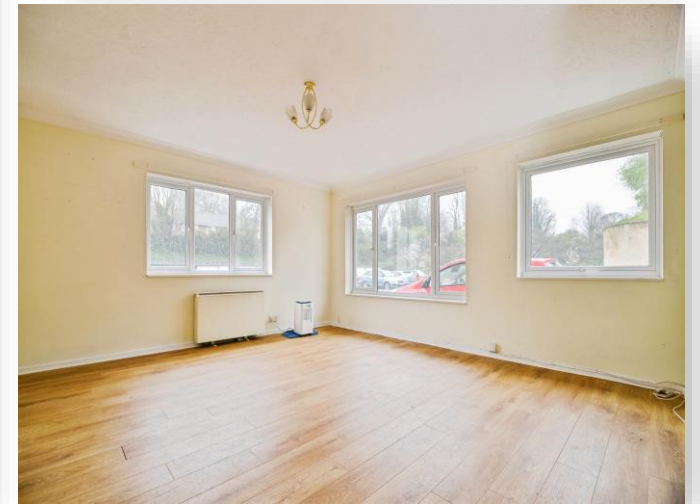
Anstey House Claymond Court, Stockton-On-Tees TS20 1HT