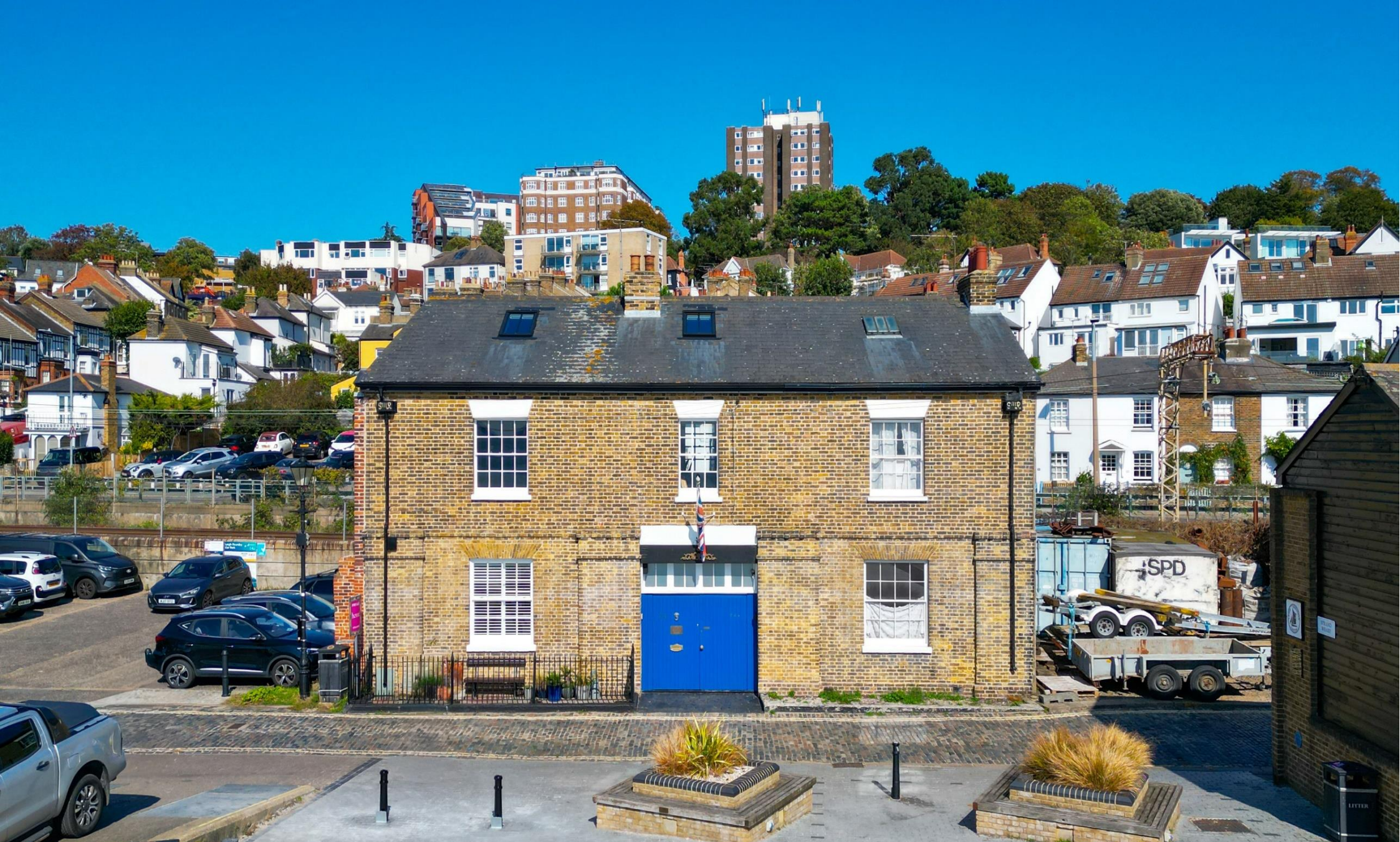
The Old Custom House