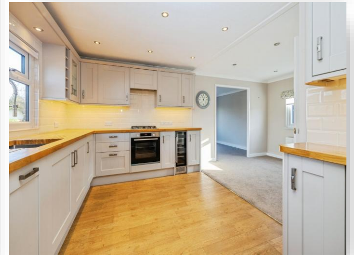
Birch Grove, Torksey LINCOLN LN1 2EZ