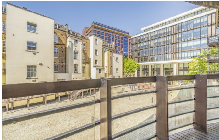
Park Street, SE1