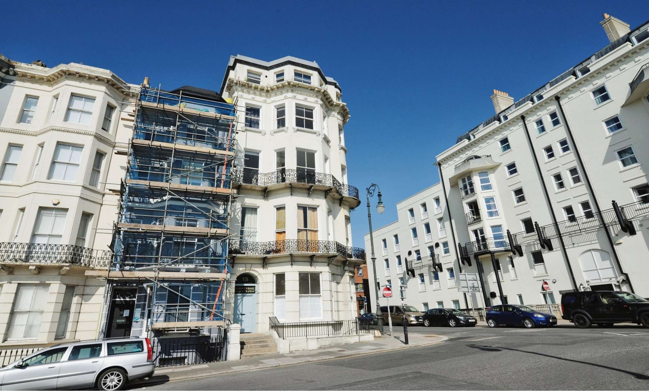
Bumptious Mansions Warrior Square, St. Leonards-On-Sea TN37 6BA