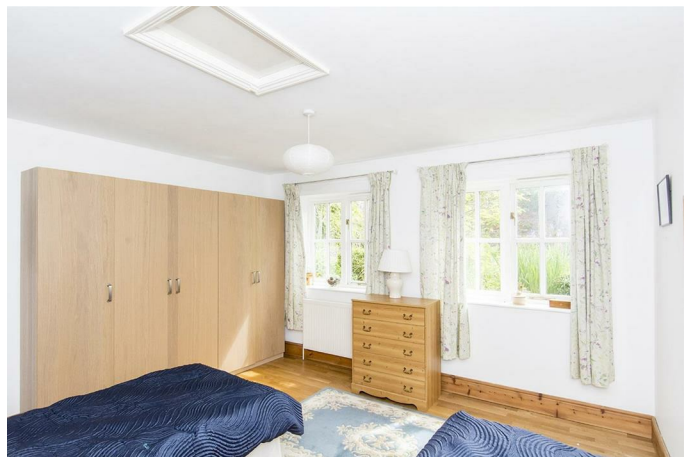
Bedroom Two 12'8" x 13'0 (3.86m x 3.96m)

A double bedroom with two windows to the rear aspect with views over the garden. Oak laminate flooring throughout. Loft access via a loft hatch. Fitted wardrobes.