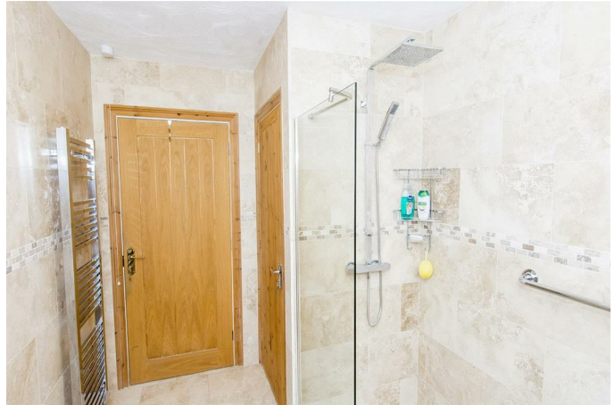
Bathroom (Photo Two)