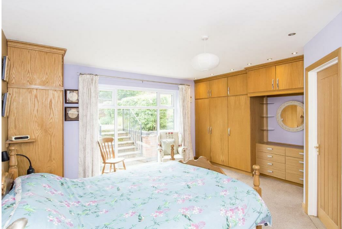
Master Bedroom 16'3" x 15'6" (4.95m x 4.72m)

A double bedroom with a large picture window to the side aspect with views over the garden.. Fitted wardrobes and drawers.