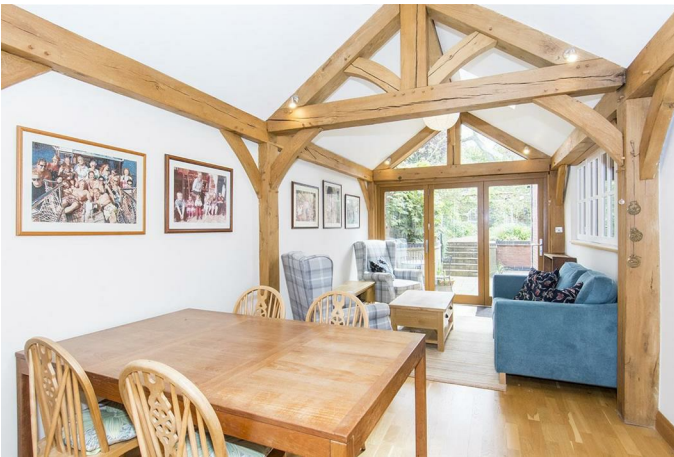
Garden Room 9'9" x 19'5" (2.97m x 5.92m)