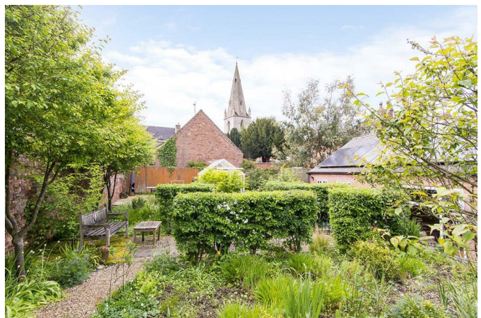
Garden (Photo Two)

The rear garden can be accessed via gated side access. The beautifully landscaped garden has an array of mature planting, lawned & gravelled areas as well as various seating areas - great for entertaining guest and enjoying al fresco dining - a paved courtyard area, oil tank, shed, greenhouse, external lighting and power. Personal door to the garage.