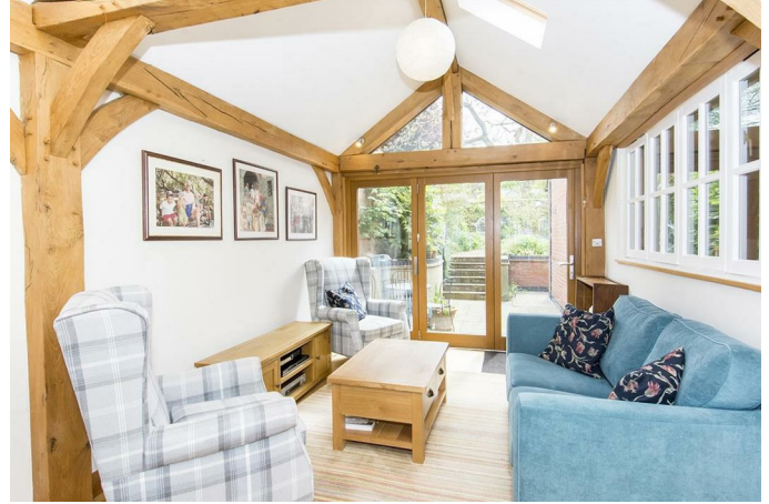
Garden Room (Photo Two)