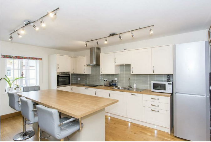
Kitchen (Photo Two)