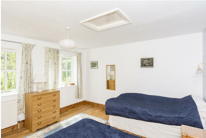
Bedroom Two (Photo Two)