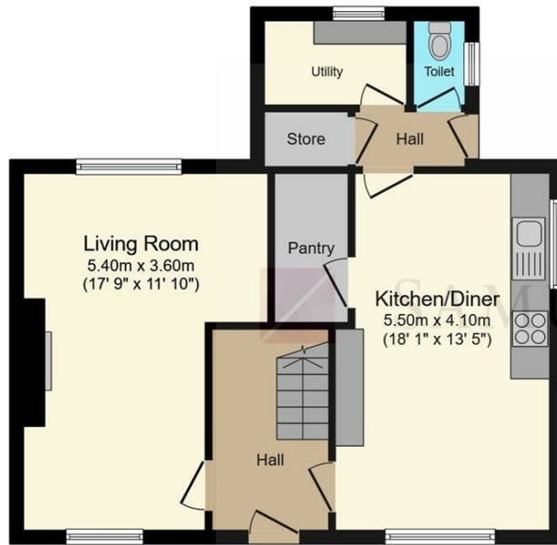
Ground Floor Floor area 51.8 sq.m. (558 sq.ft.)