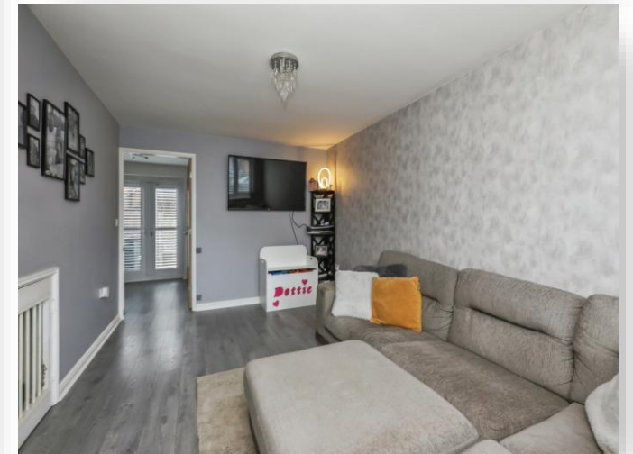
Pickhills Grove, Goldthorpe Rotherham S63 9FN