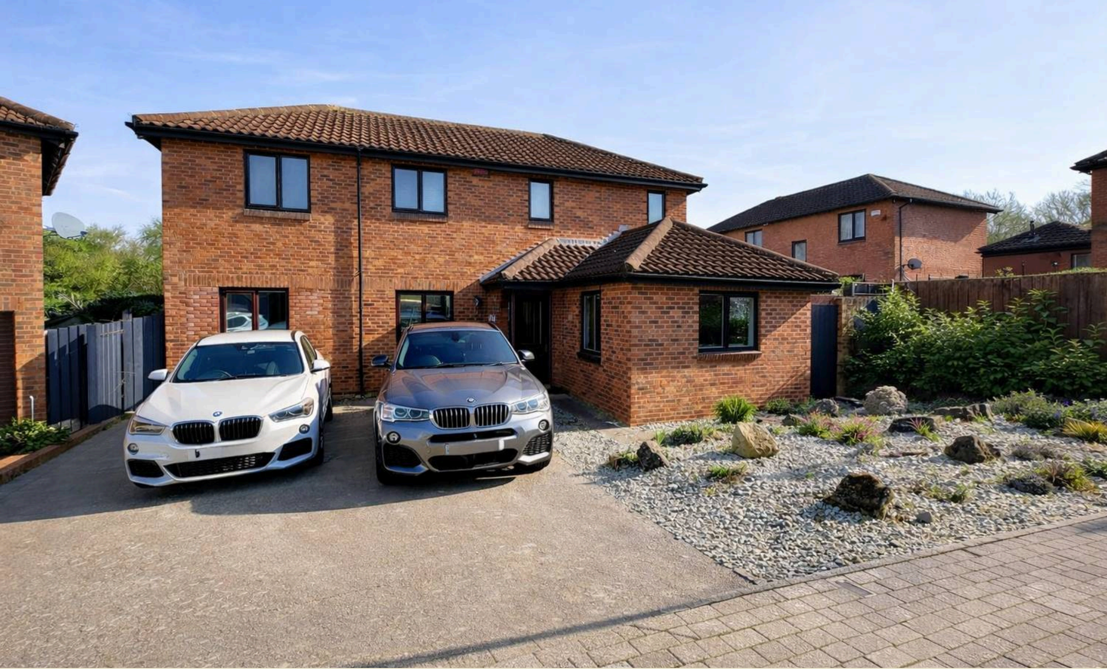
7 Coberley Close, Downhead Park £620,000