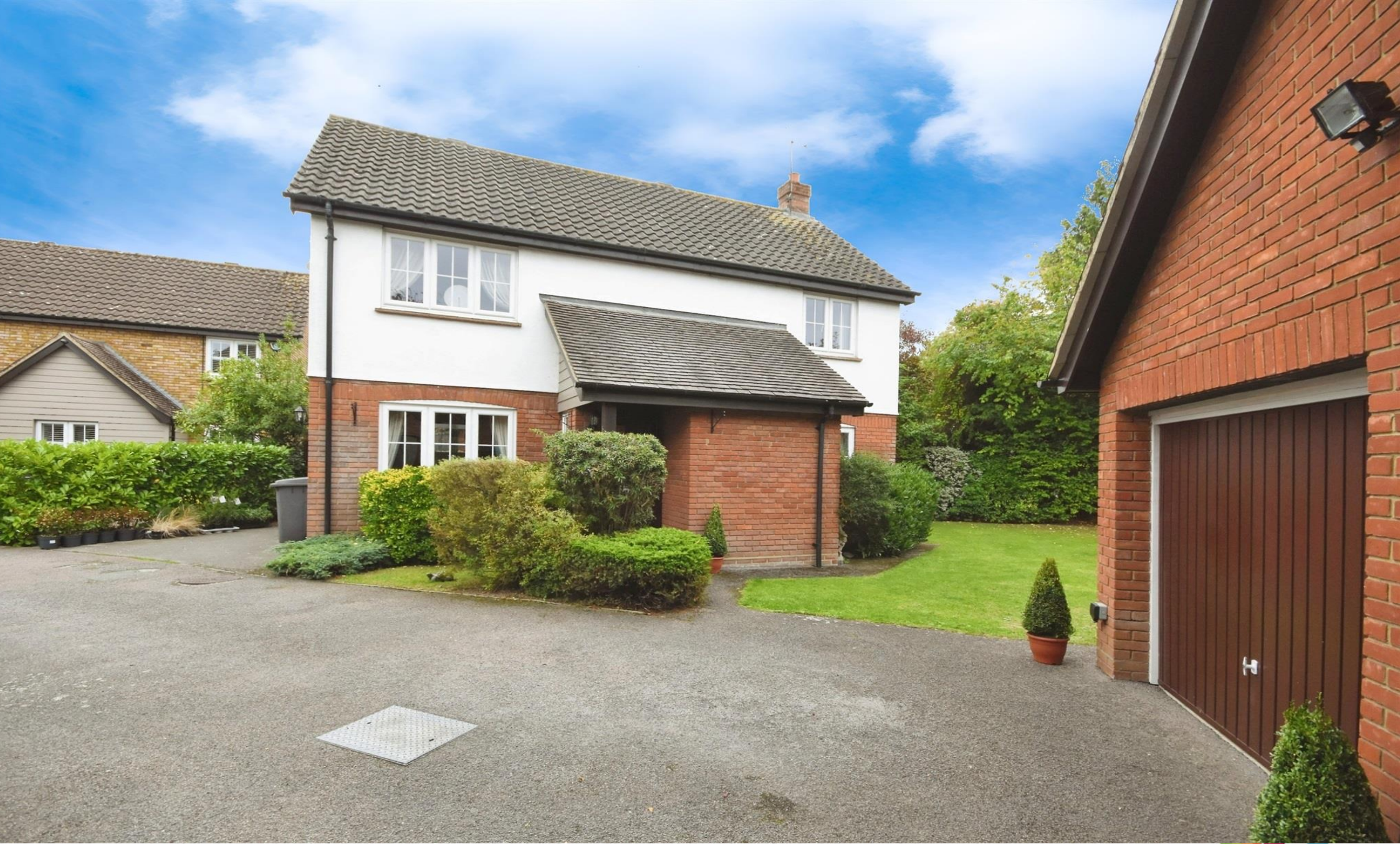
Fawkner Close, Chelmer Village, Chelmsford CM2 6UP