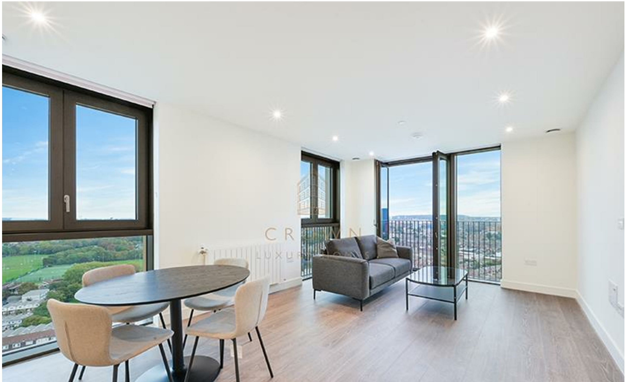
Flat 2203, Menara Point 1 Affinity View, London, E16 4EF £3,000