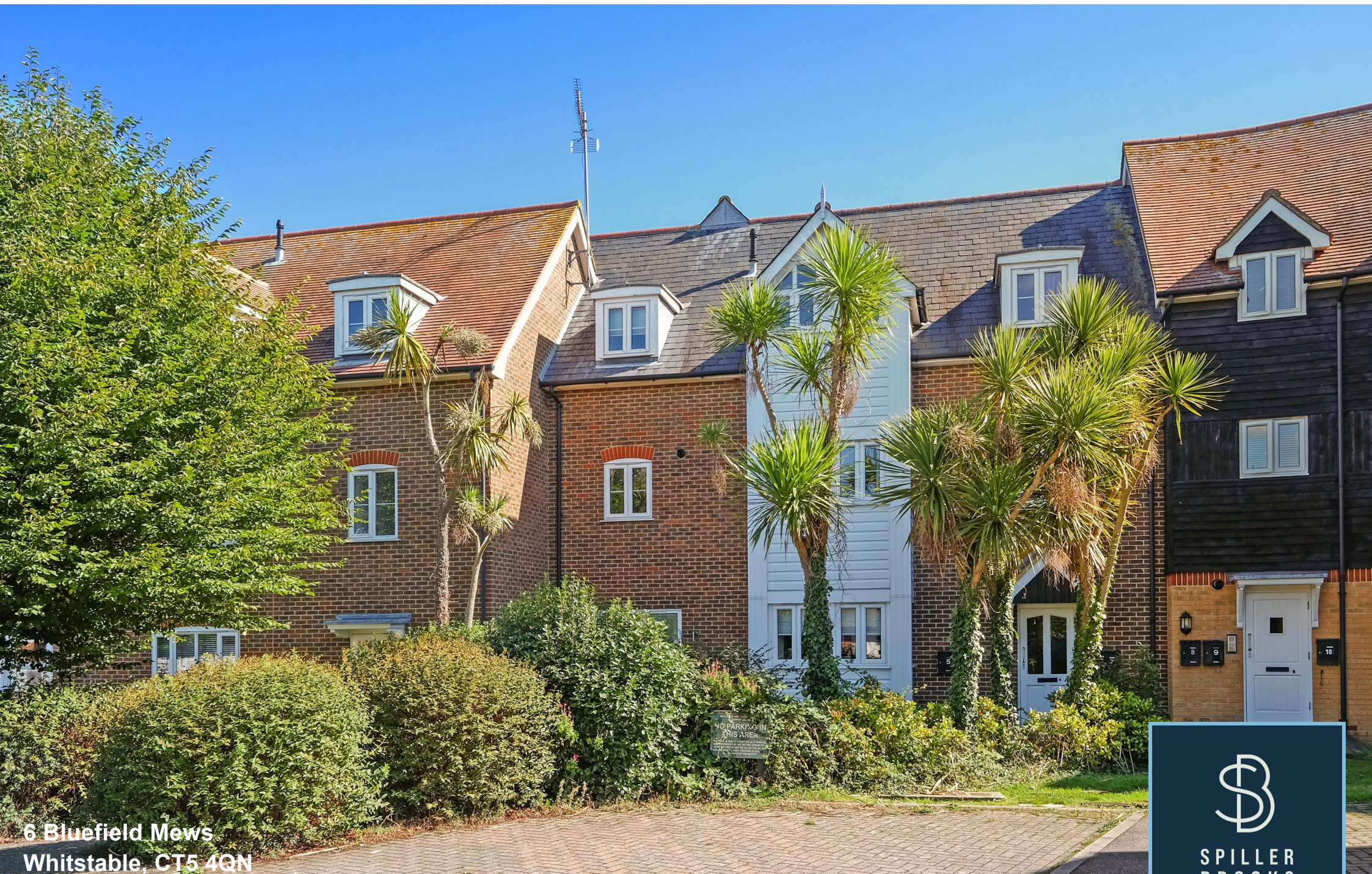
6 Bluefield Mews Whitstable, CT5 4QN