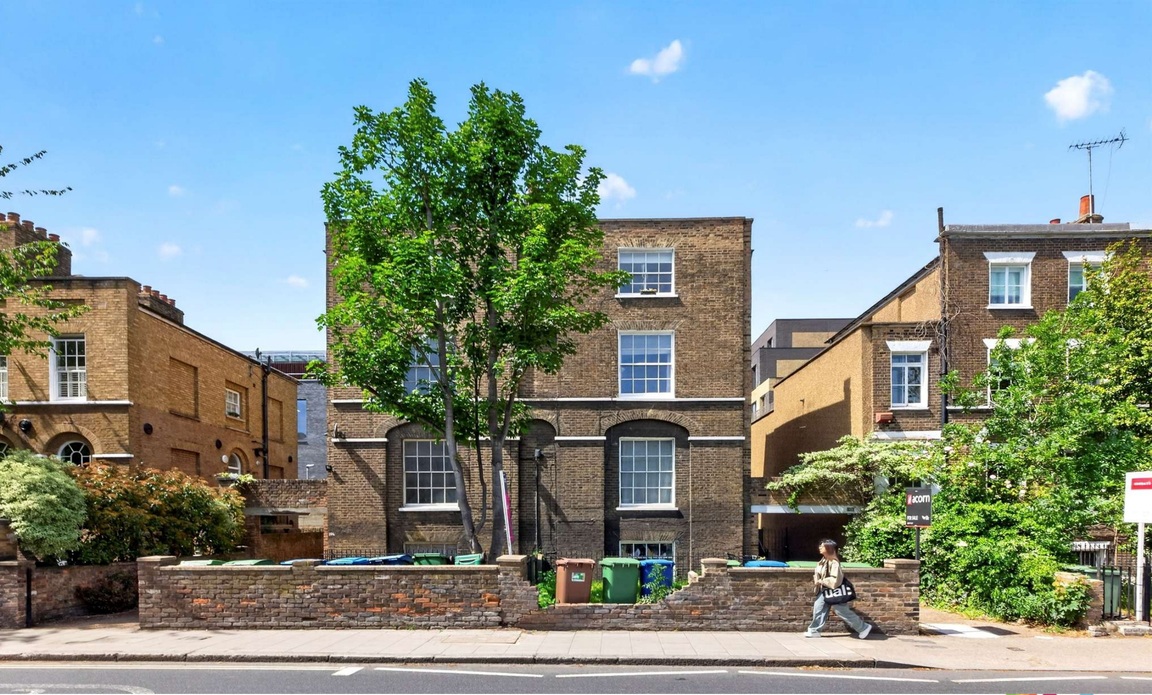
Peckham Hill Street, London SE15 5JT