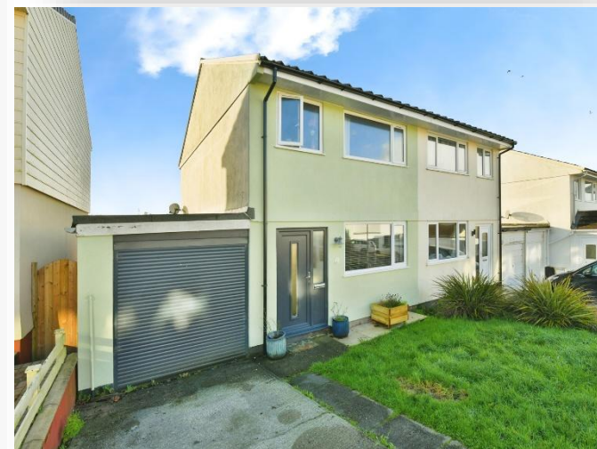
Fairmead Close, Hatt Saltash PL12 6SB