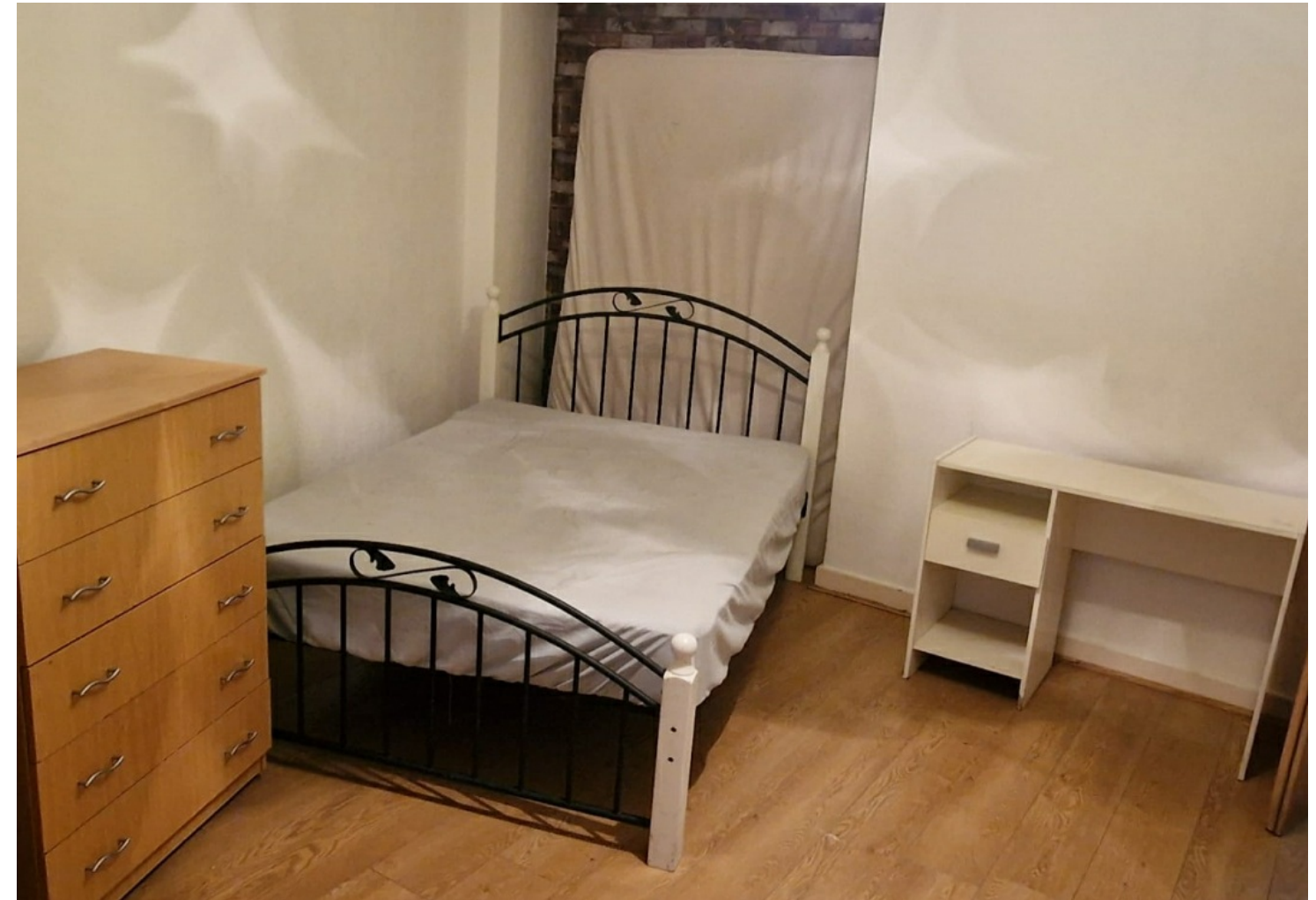
Newport Road, CF3 4AJ