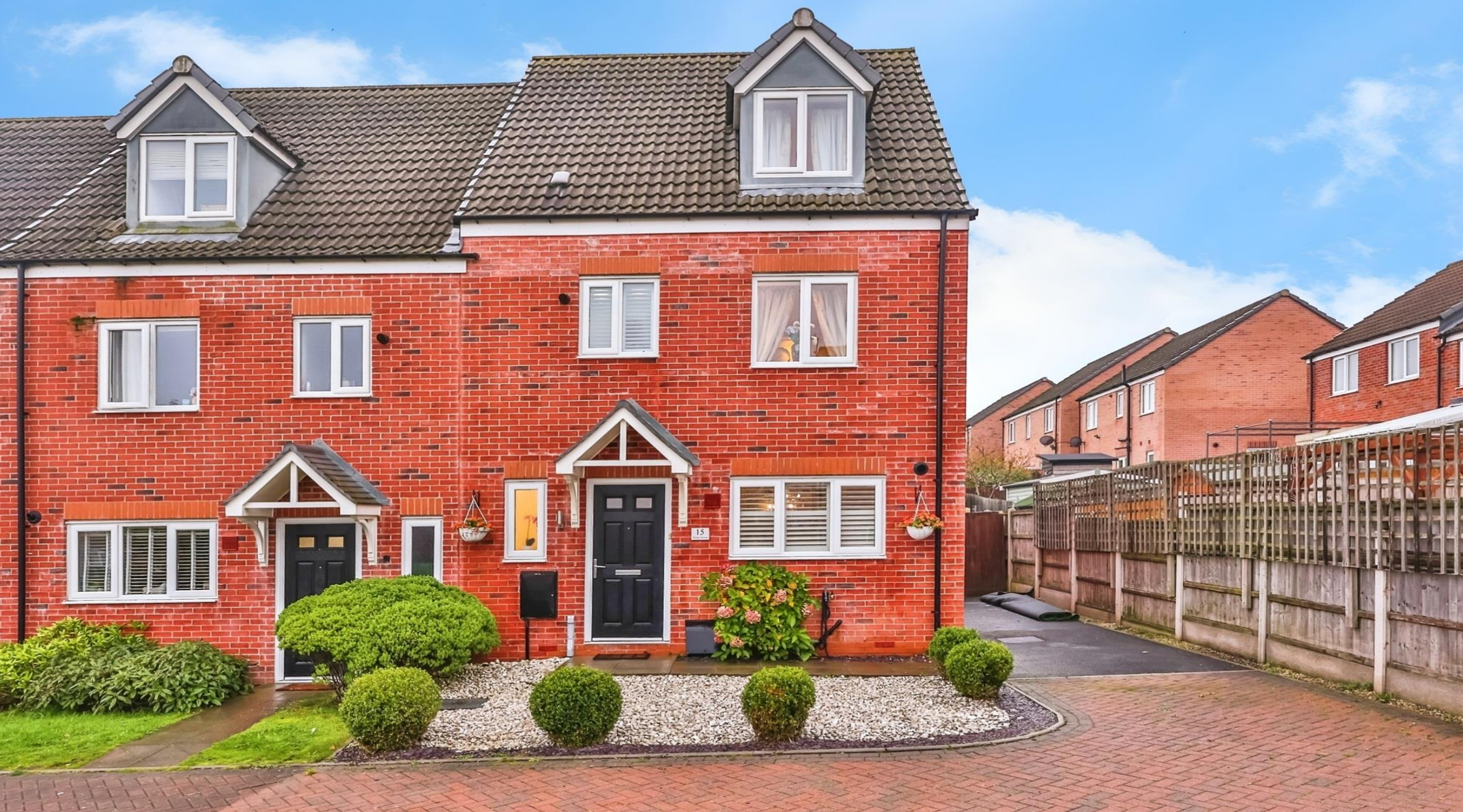
Pella Grove Annesley Nottingham