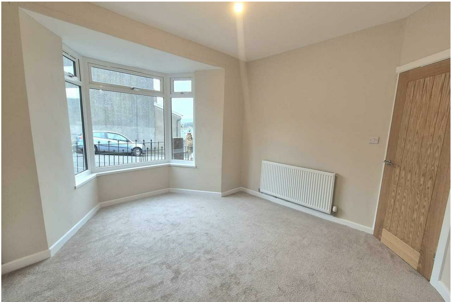
Bedroom 2 Image 2