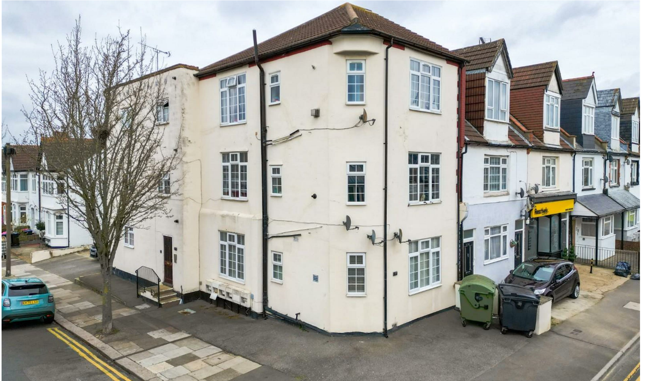
Pall Mall, Leigh-On-Sea £199,995