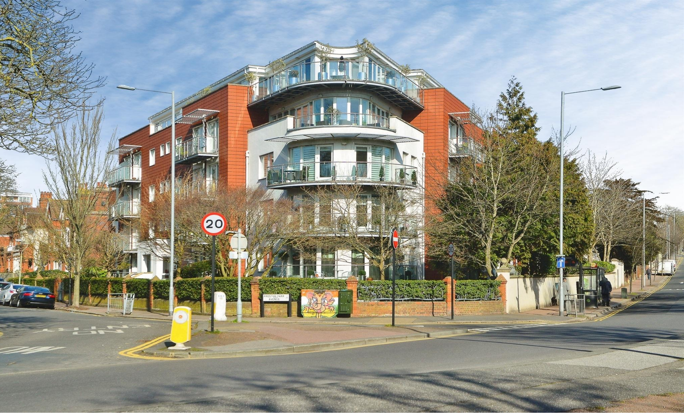
Preston Mansions, Stanford Avenue, Brighton, BN1 6AX