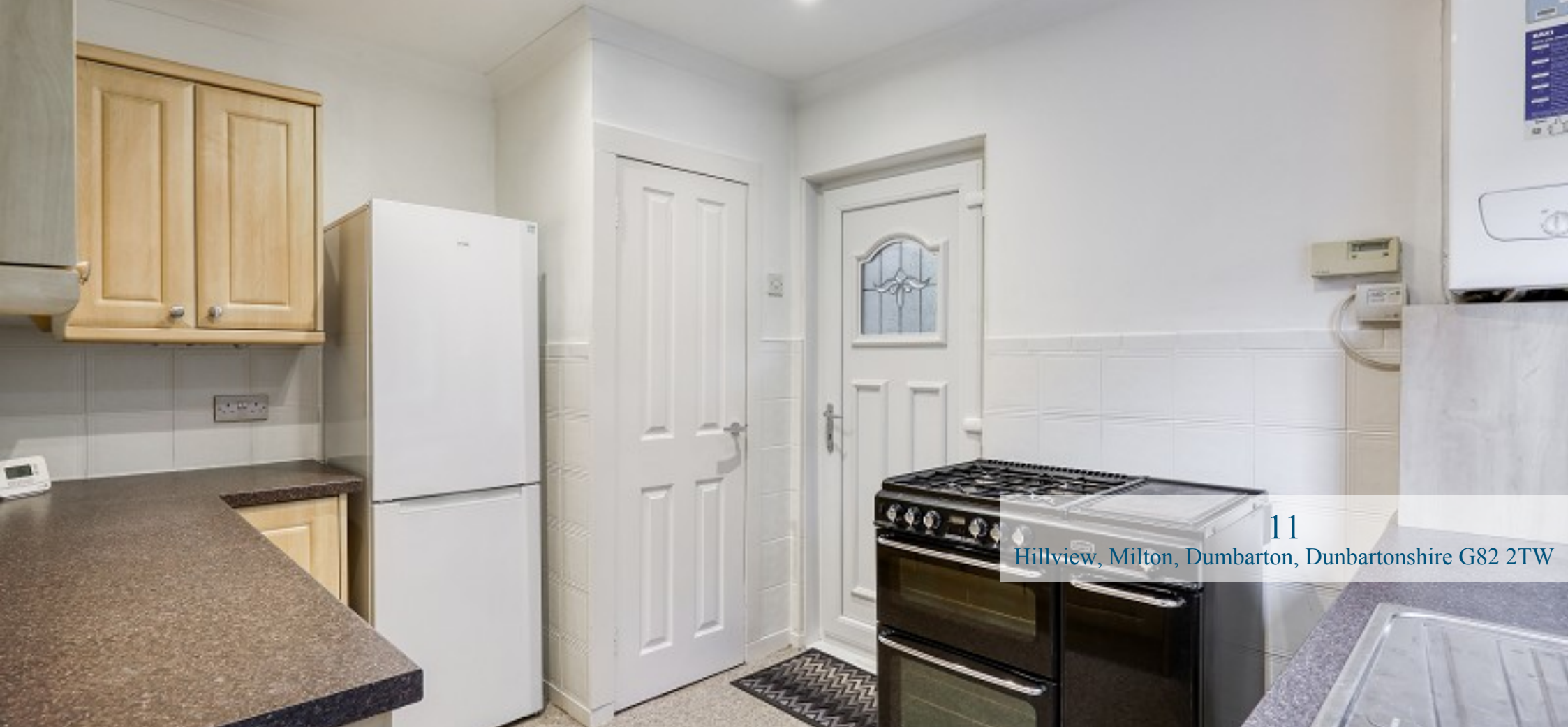
11 Hillview, Milton, Dunbarton, Dunbartonshire G82 2TW