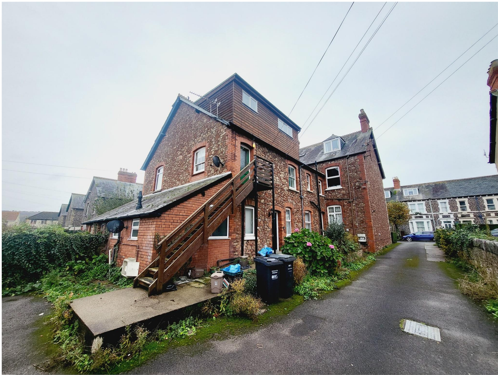
Glenmore Road, Minehead, TA24 5BQ