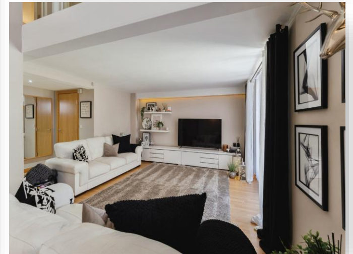
East Float Quay, Dock Road, Birkenhead, CH41 1DP