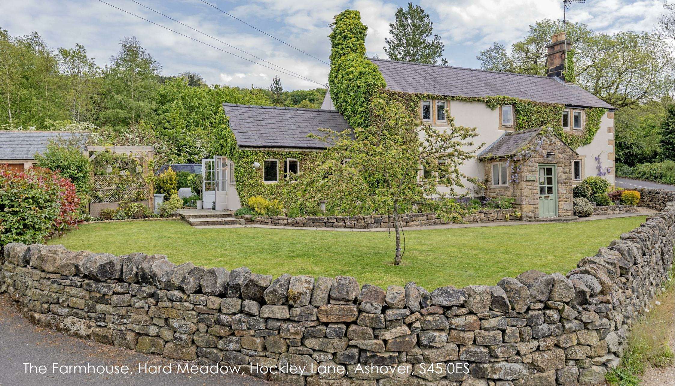
The Farmhouse, Hard Meadow, Hockley Lane, Ashover, S45 0ES