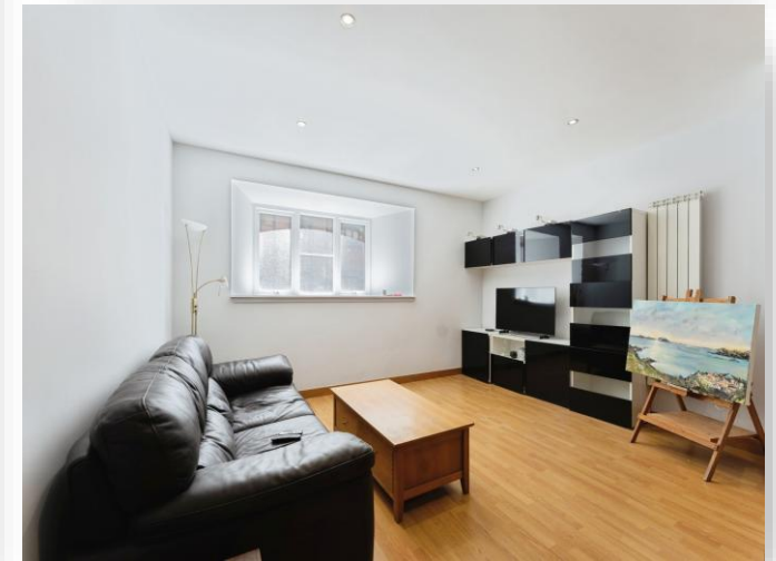
East Float Quay, Dock Road, Birkenhead, CH41 1DP