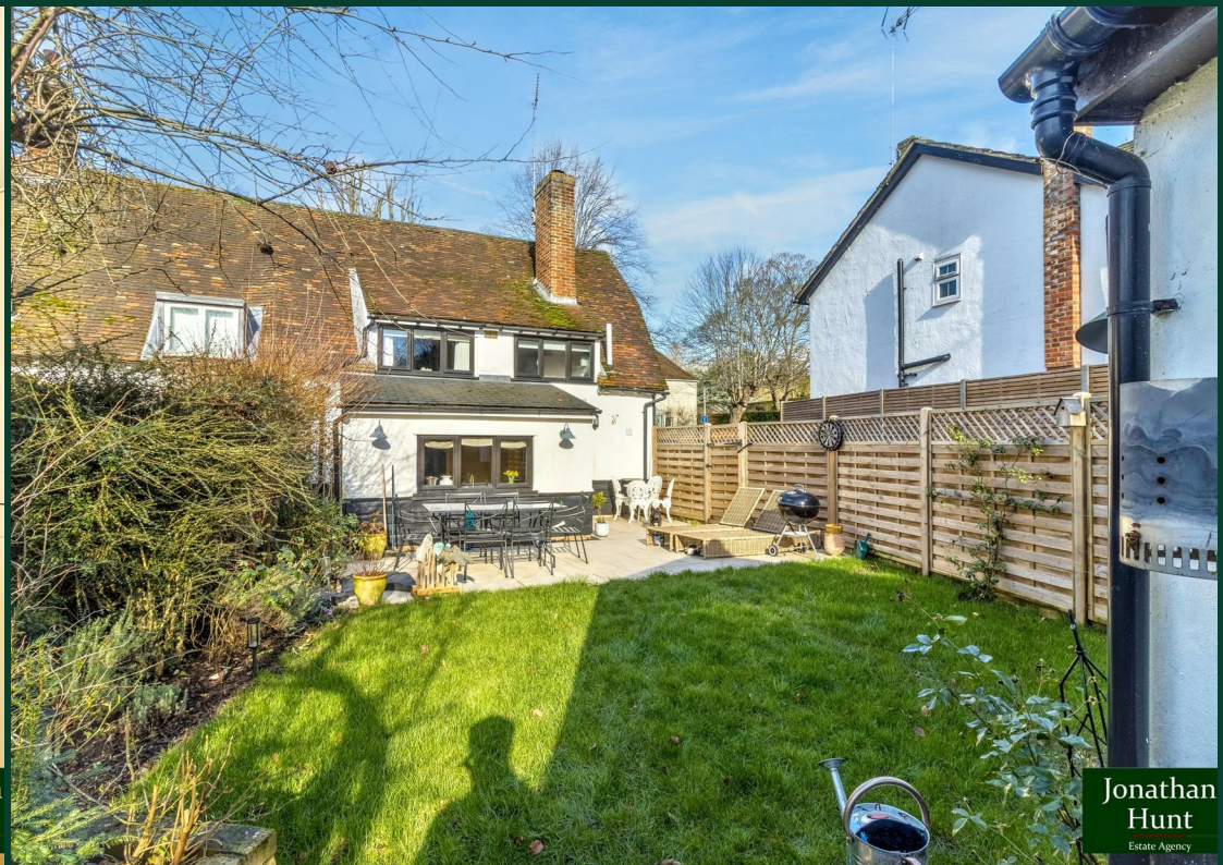
Jonathan Hunt Estate Agency