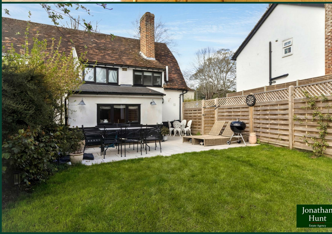
Jonathan Hunt Estate Agency