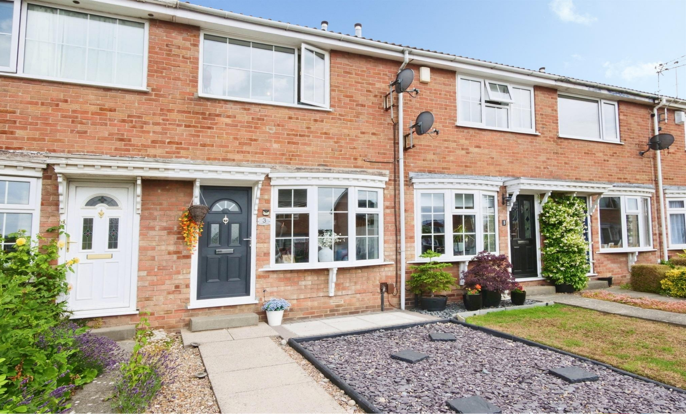
Cayley Close, York YO30 5PT