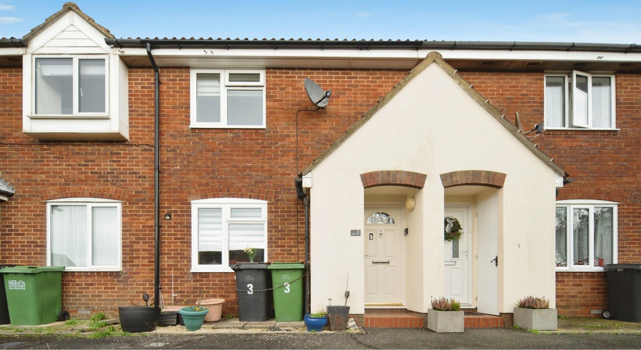
St. Catherines Close, St. Leonards-On-Sea TN37 6SR