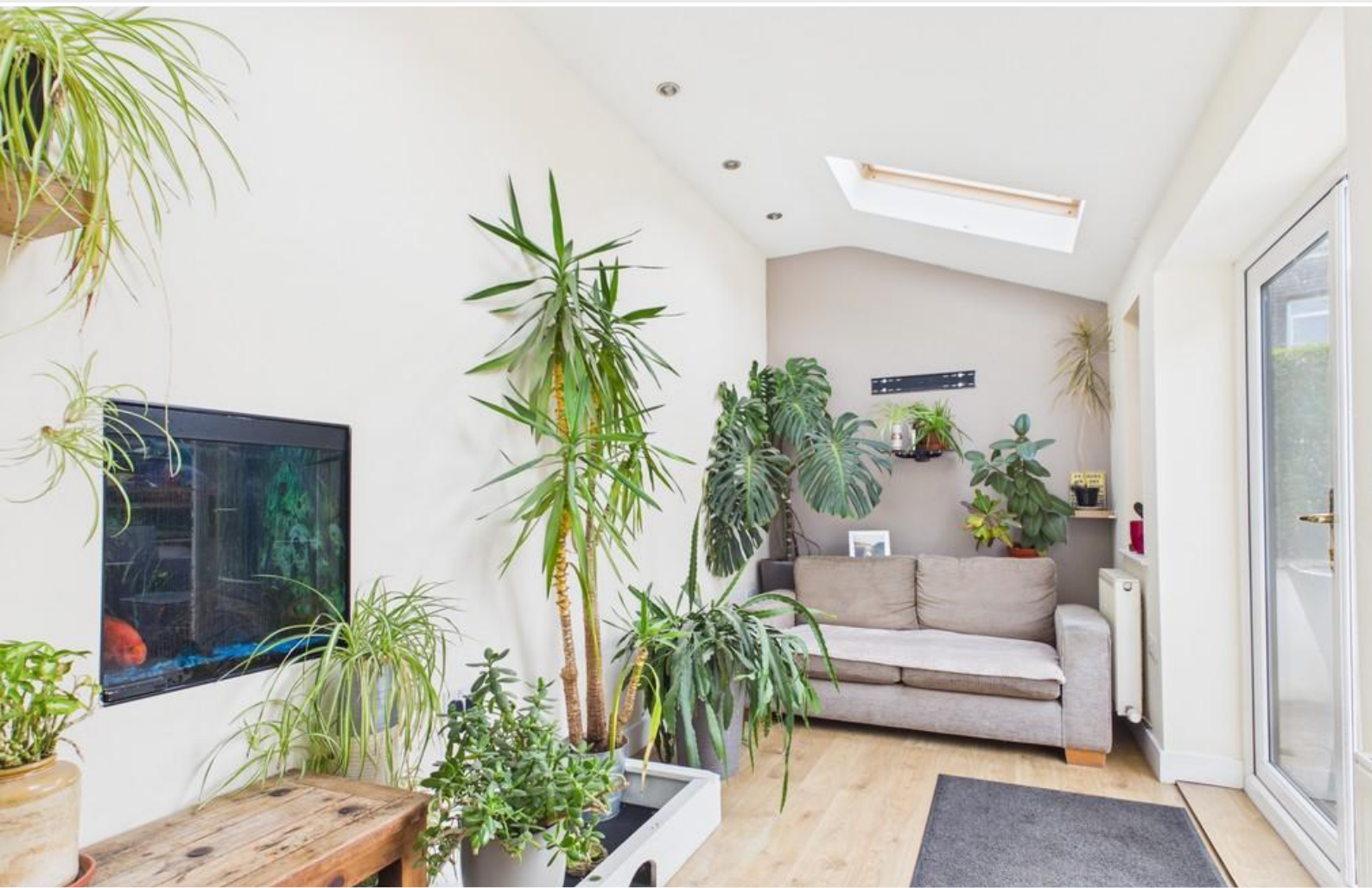
Family Garden Room