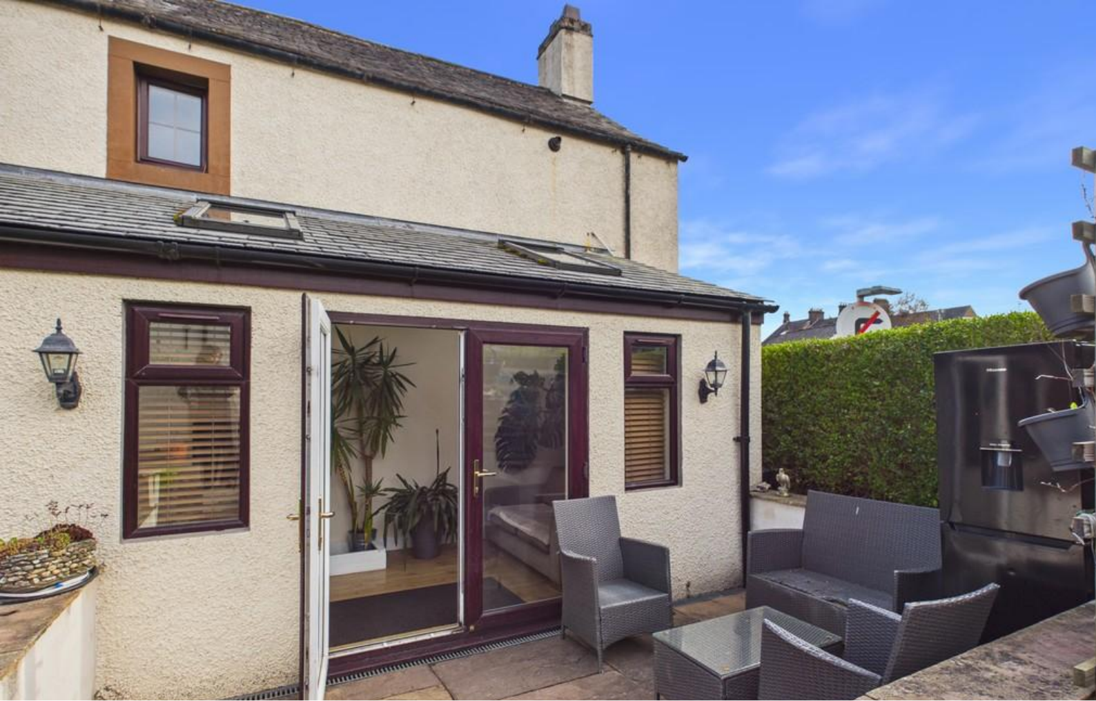
Patio Seating Area