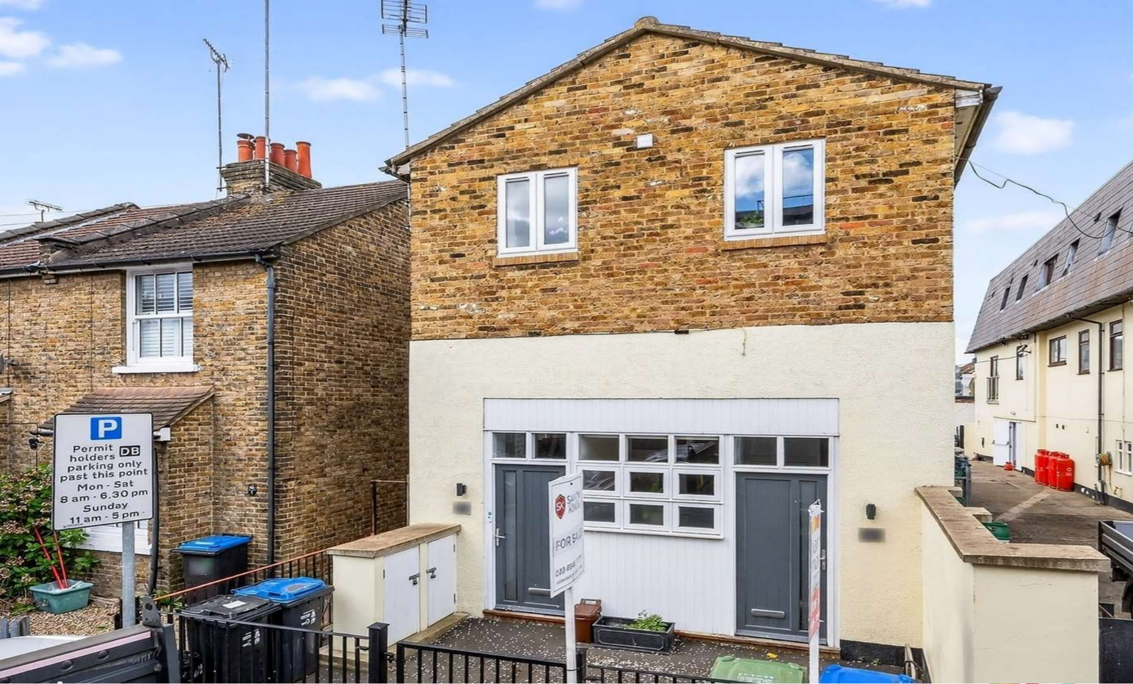
Dunbar Road, New Malden, KT3 3RF