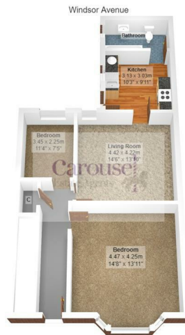
Total Area: 75.9 m 2 ... 817 ft 2 All measurements are approximate and for display purposes only