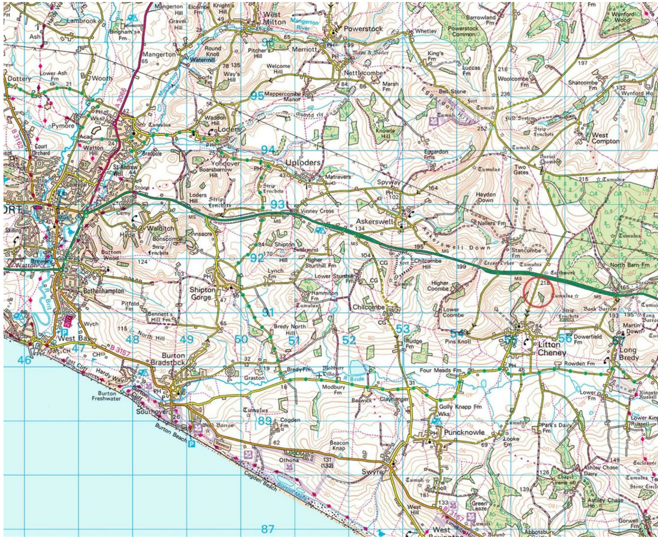
Burraton House/GJW & OC/10.04.26