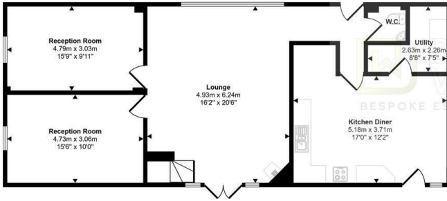
Ground Floor Approx 94 sq m / 1009 sq ft

Approx Gross Internal Area 173 sq m / 1866 sq ft