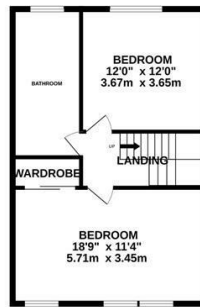
2ND FLOOR 539 sq ft. (50.0 sq.m.) approx.