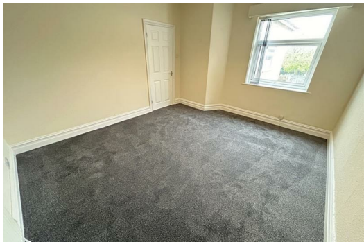
1 St. Margarets Road, Prestwich, Manchester, M25 2QB