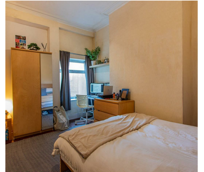
Whitchurch Road, Heath