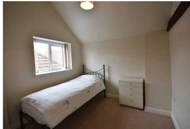
BEDROOM THREE 9' x 9'4 (2.74m x 2.84m)

With gable window, vaulted ceiling, exposed Collar beams, radiator.