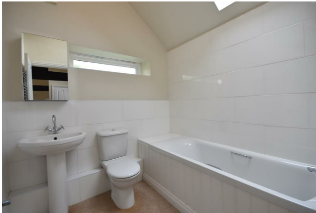
ENSUITE 6'11 x 6'7 (2.11m x 2.01m)

Electric shower over the bath, pedestal basin, low suite WC, half tiled walls. Velux roof light and Gable window. Chrome heated towel rail, fitted cabinet and shaver point.