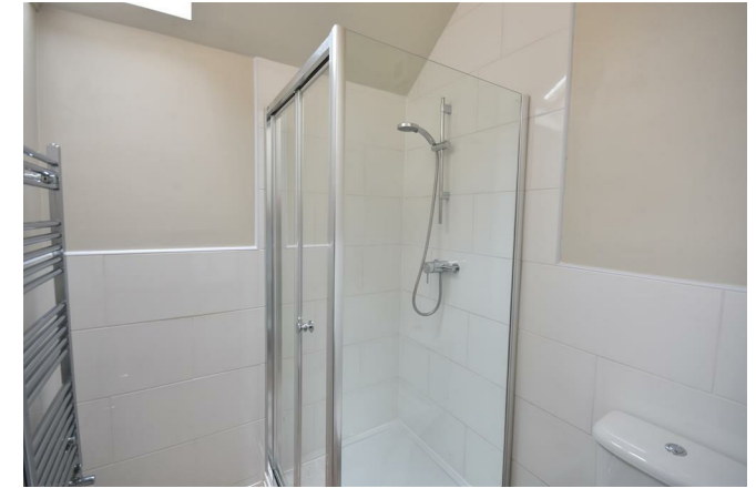
FAMILY SHOWER ROOM 6'8 x 5'6 (2.03m x 1.68m)

Shower with chrome fitting, basin, low suite WC, heated towel rail, half tiled walls, Velux rooflight.