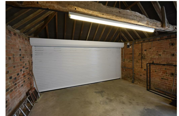
DOUBLE GARAGE 16' x 15'2 (4.88m x 4.62m)

Electric roller shutter door and power points.