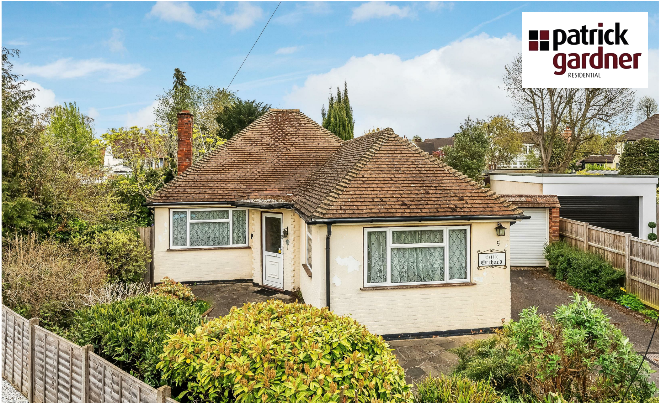
Little Orchard, 5 Richbell Close, Ashted, Surrey, KT21 2JR