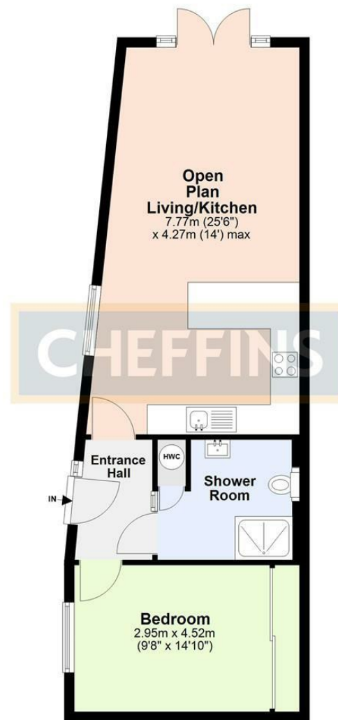
Total area: approx. 54.9 sq. metres (590.9 sq. feet)