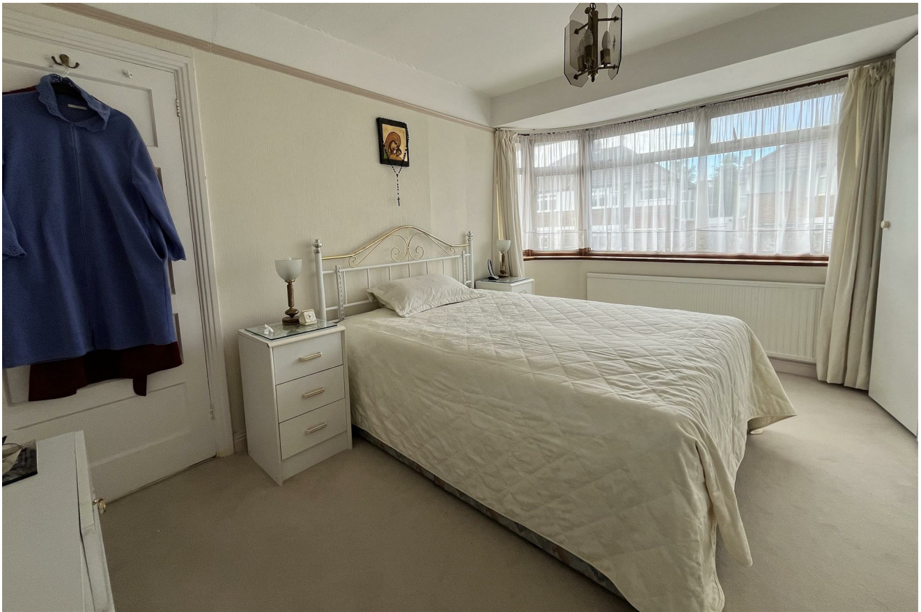
BEDROOM 2: 13'7 x 11' (4.14m x 3.35m) Double Glazed Window to Rear, Fitted Wardrobes, Radiator.