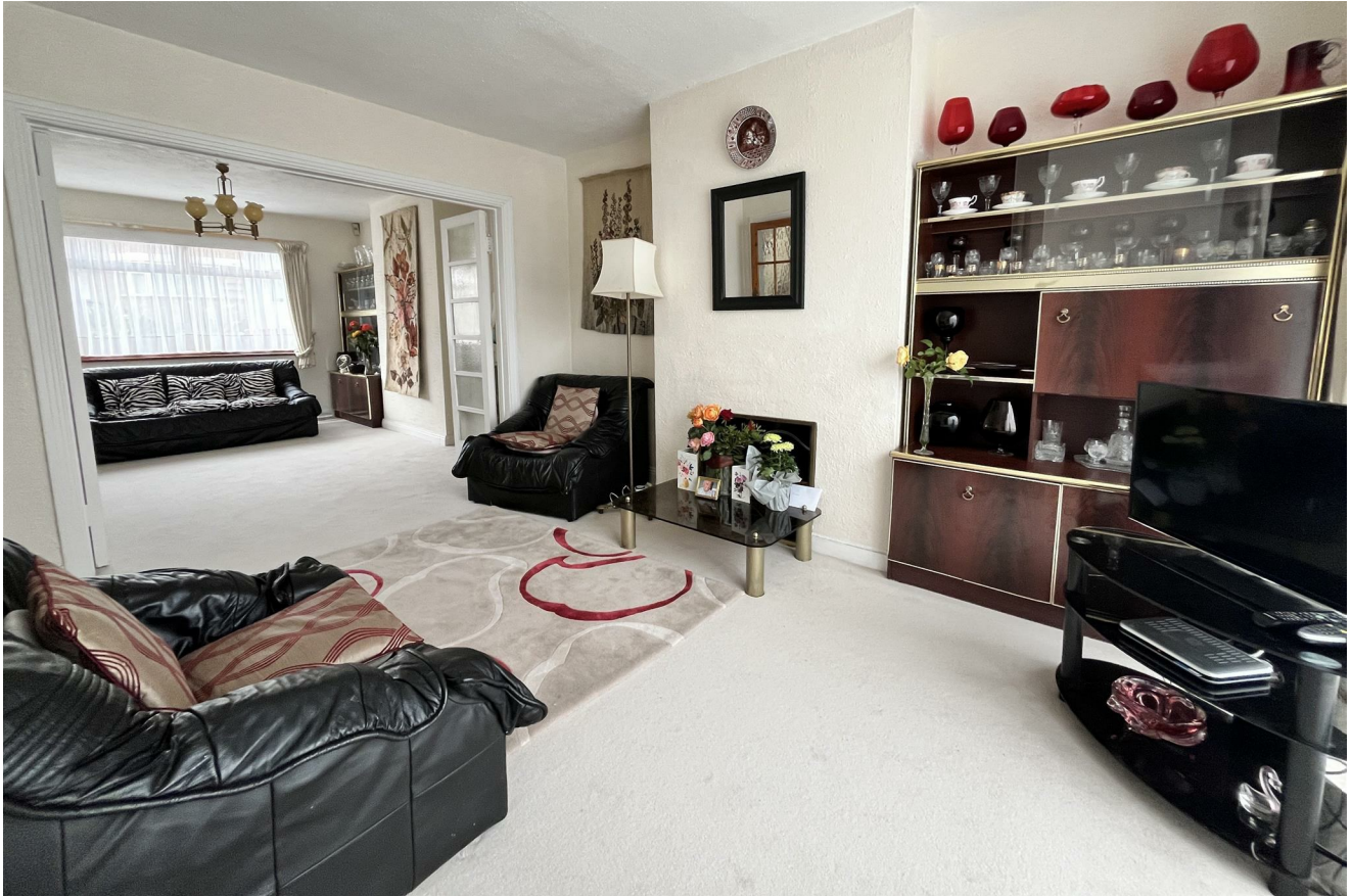
REAR RECEPTION ROOM: 13'3 x 11' (4.04m x 3.35m)

Double Glazed Sliding Patio Doors to Patio & Rear Garden, Radiator, New Fitted Carpets. Archway to: