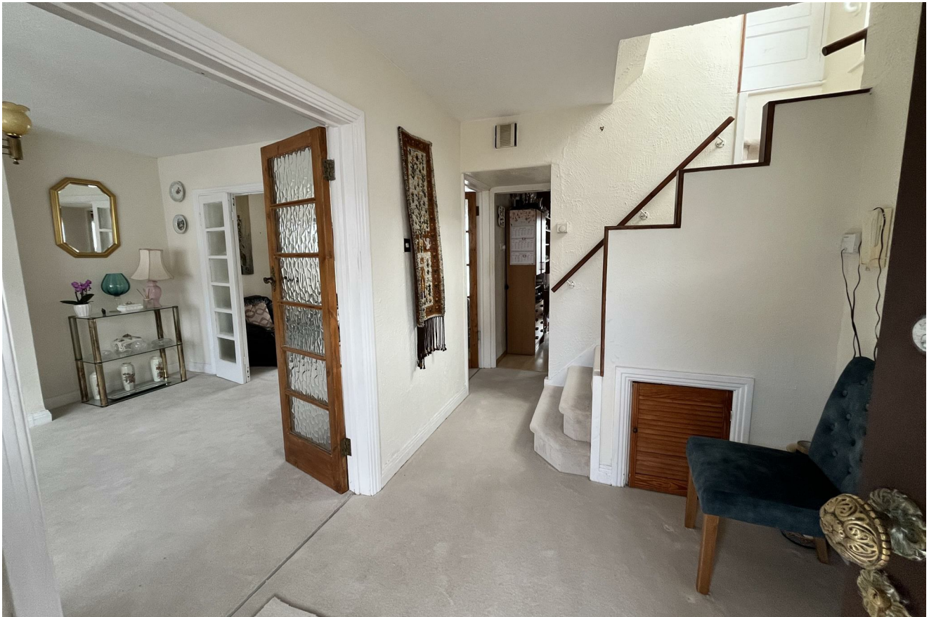
THROUGH LOUNGE: PIC. 1 26'6 x 11' (8.08m x 3.35m)

Spacious with Georgian Fanlight Wooden Door, Window to Side, Radiator. Access to Through Lounge/Both Rooms and Kitchen/Diner, plus Turning Staircase to First Floor. New Fitted Carpets.