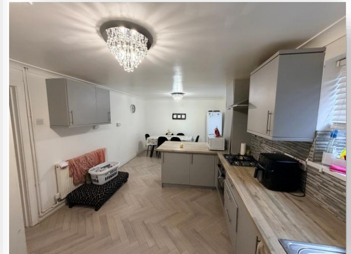
Eastleigh Road, Peterborough PE1 5JQ