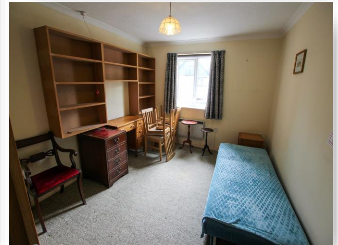
Burling Court, Cambridge, CB1 8EB