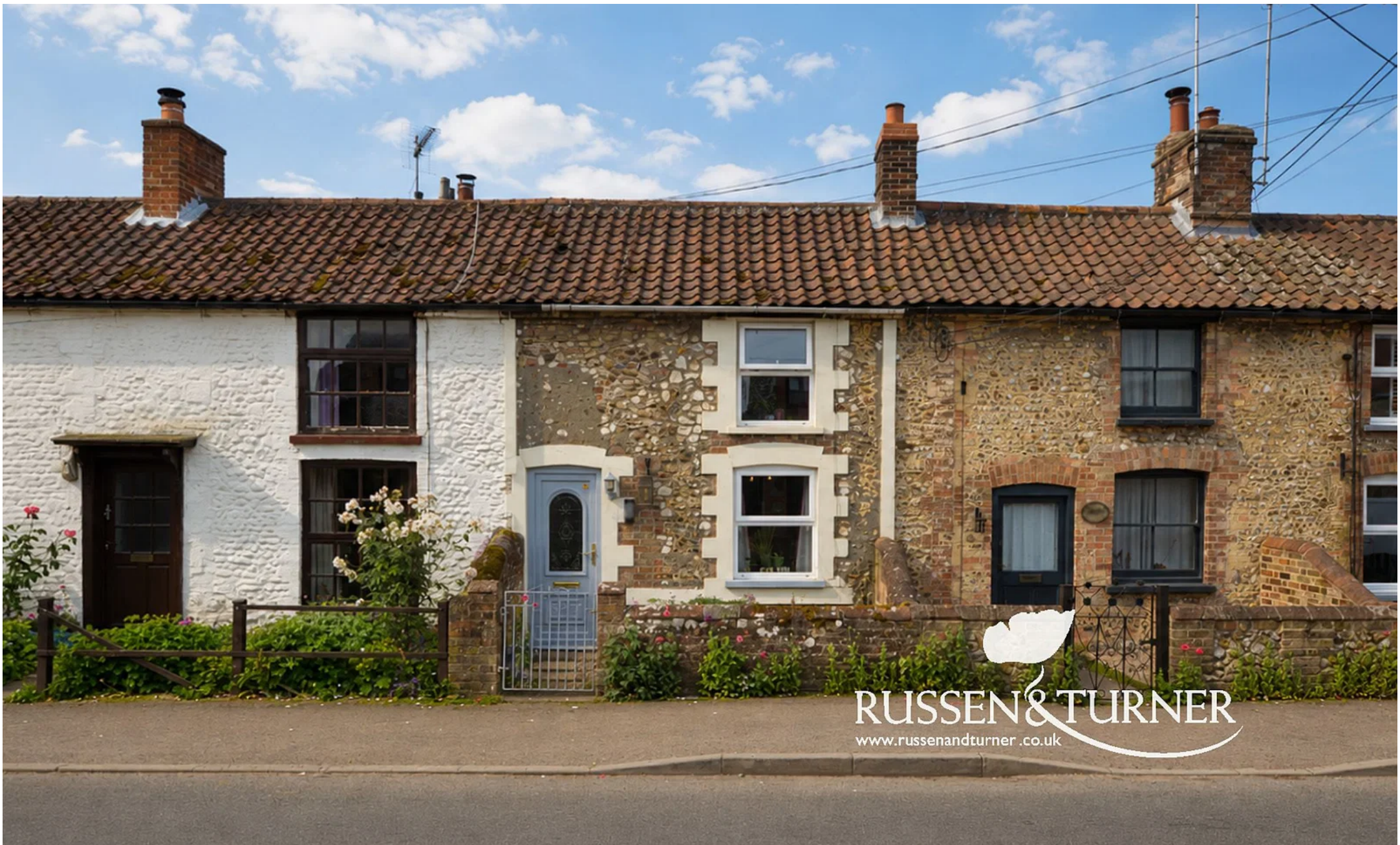
Charming Character Cottage in Gayton King's Lynn