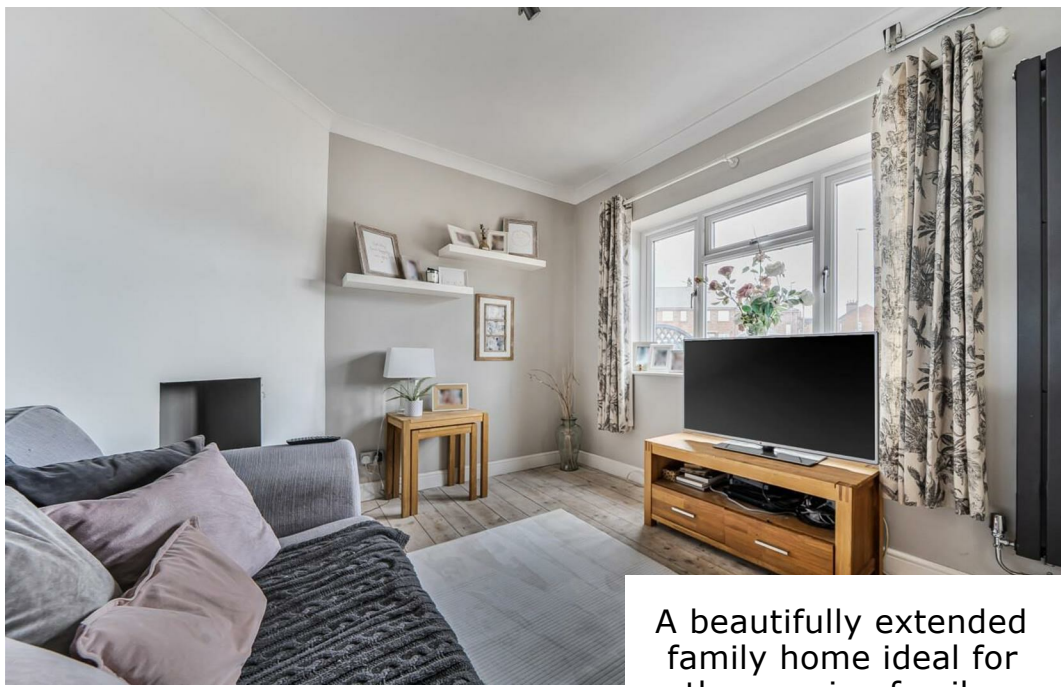
A beautifully extended family home ideal for the growing family.