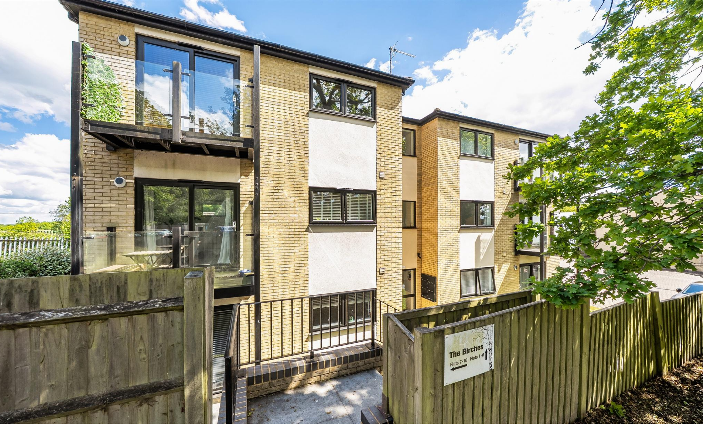
The Birches Sandridge Park, St. Albans AL3 6ER