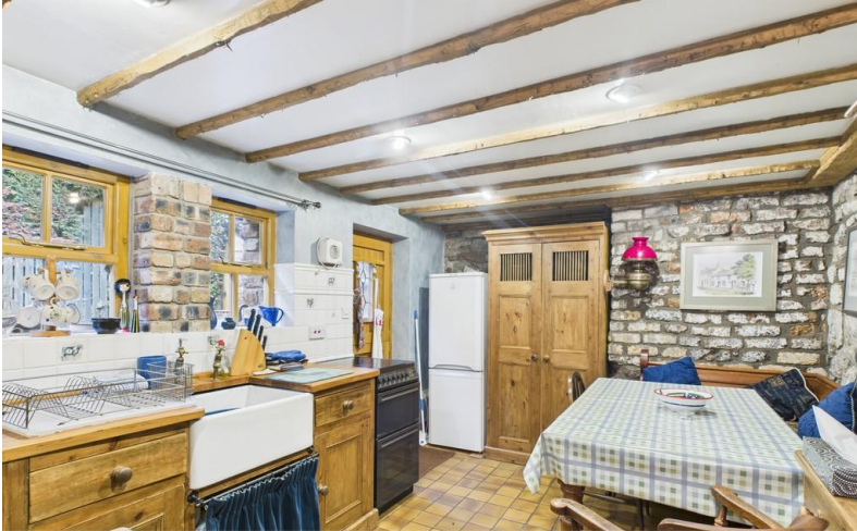
Kitchen/ dining room