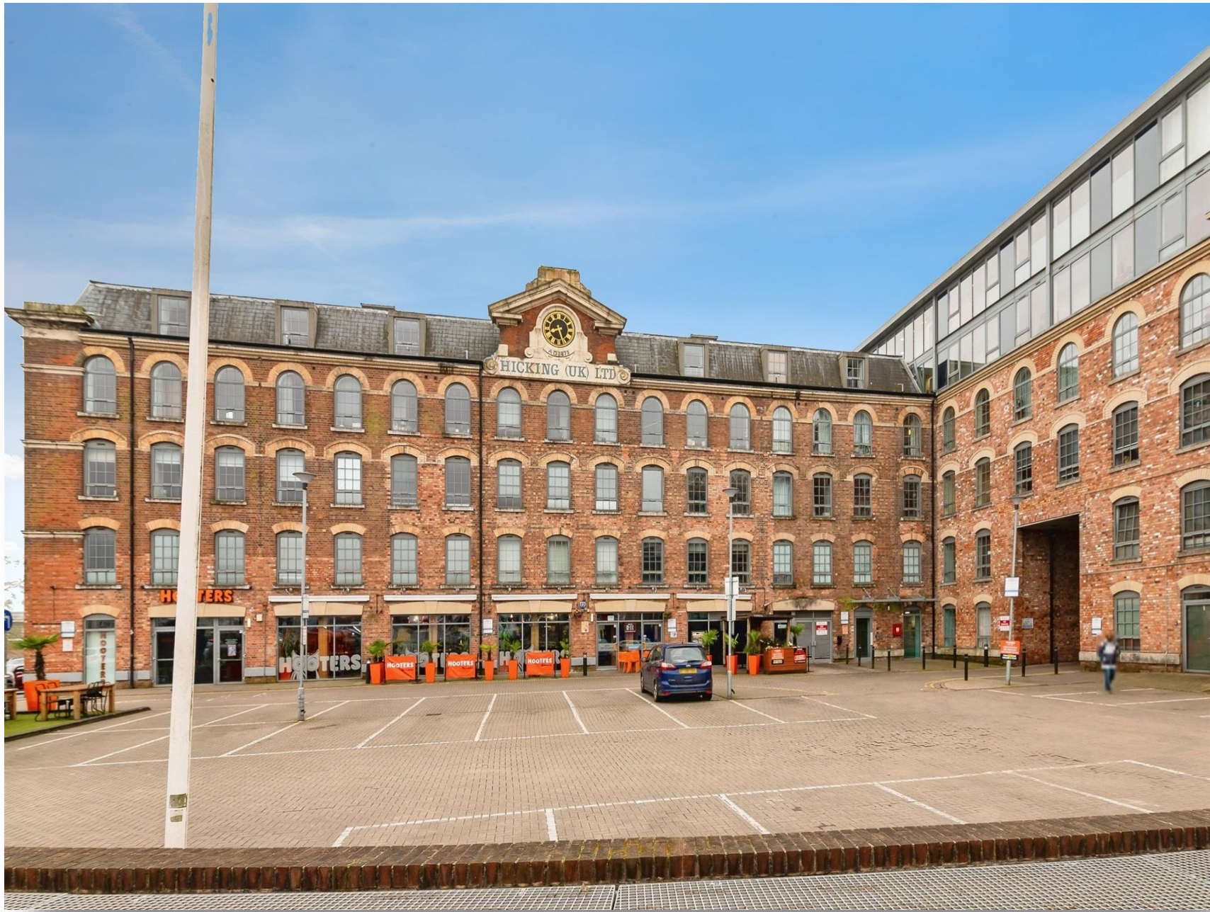
Block 3 The Hicking Building Queens Road, Nottingham NG2 3BU