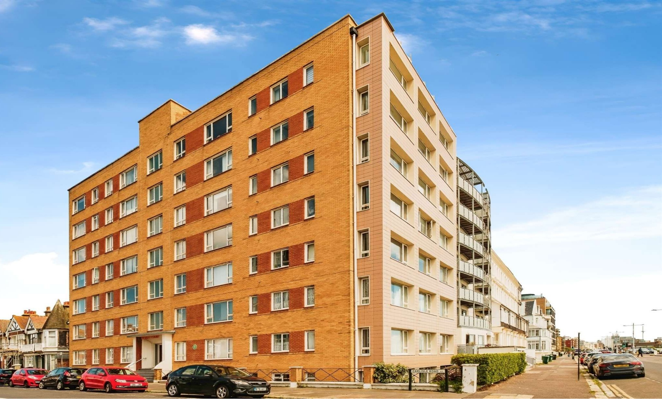
Dorset Court Kingsway, Hove BN3 4FD